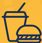
Restaurant & Food