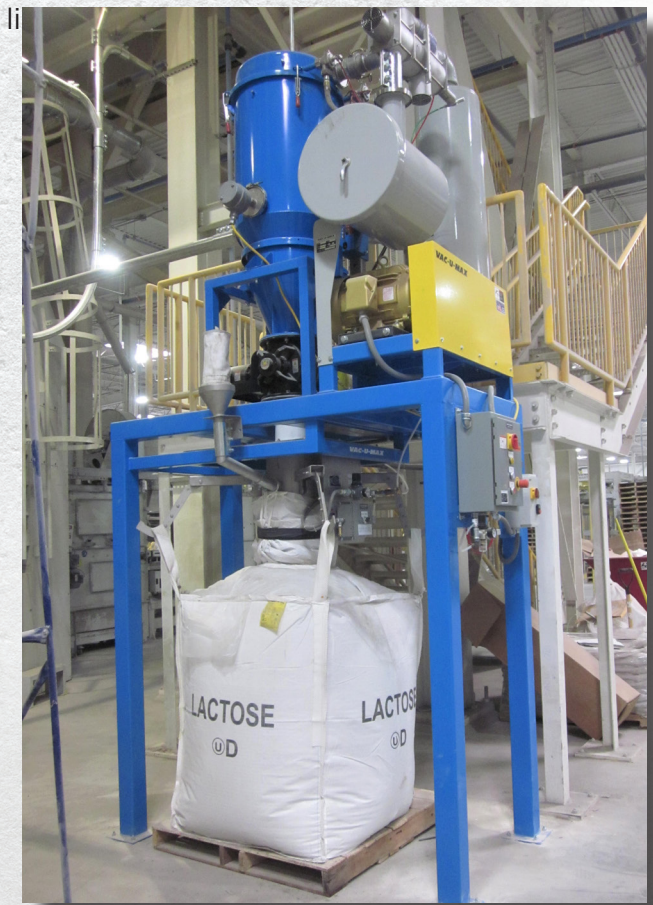
Central vacuum cleaning system with source capture and reclaim into bulk bag for potential reuse, recycle, or disposal.

Stationary central vacuum systems are ideal for environments requiring continuous 24/7 operation and the simultaneous use of up to 20 pickup points. These systems employ powerful stationary industrial vacuum cleaners that have strategically placed piping throughout a facility connecting hoses to a common