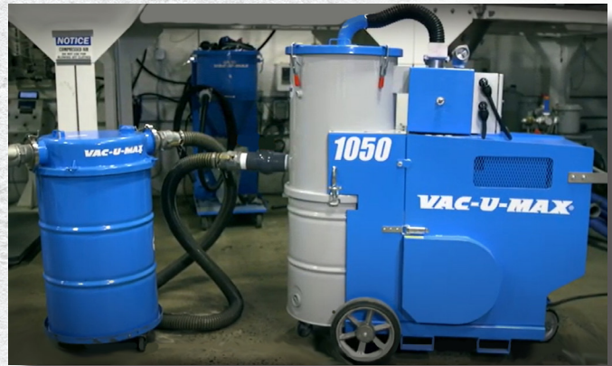
Model 1050 with 55-gallon material intercept features blow-back filter cleaning, allows easy access to confined areas, and is designed with forklift pockets for easy portability.

Like the smaller central vacuums and the portable air operated vacuums that allow for indoor operation, because breakaway vacuum systems have a filter separator and collector