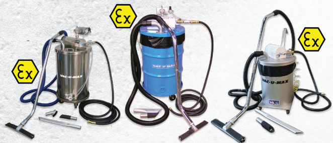
VAC-U-MAX compressed-air operated, ATEX tested and certified combustible dust vacuum cleaners are available in 15, 30 and 55 gallon collection capacities, and include drum dolly and took kit.

With combustible dust present in a facility, the