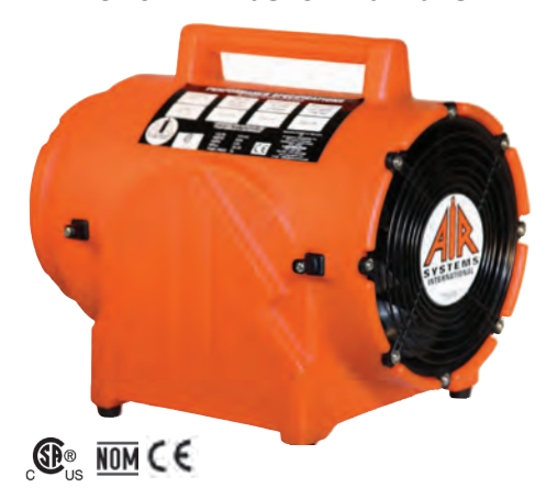
8" & 12" Plastic Axial Fans