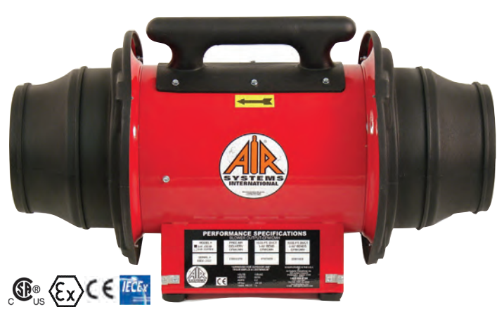
8" / 10" Steel In-Line Axial and 8" / 10" Steel Explosion-Proof In-Line Axial Fans