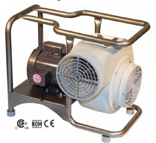
8" Standard and 2 Speed Centrifugal Electric Blowers