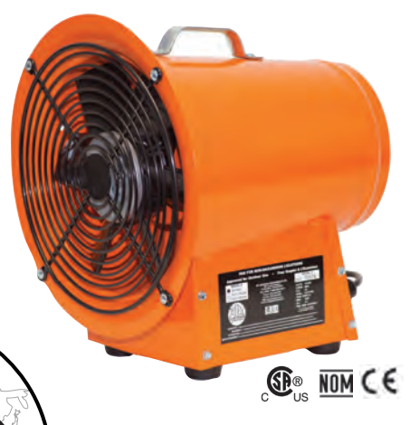
8" Steel Axial Fan