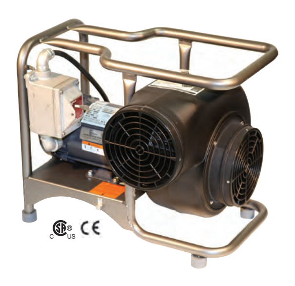
8" Explosion-Proof Centrifugal Electric Blower