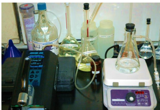
Image 1. Apparatus and instrument setup.

A 500mL Büchner flask was used for testing. The side hose barb was fitted with 24" of tubing, and at the end of the tubing an activated carbon filter was attached to ensure no mercury in the air was entering and being measured. The top of the flask was fitted with a #7 rubber stopper with a hole in it. The hole had a 12" glass tube inserted, followed by 36" of Tygon tubing. This tubing was inserted into the Jerome® J505 for mercury measurement. Once the solution was poured into the Büchner flask approximately 3" of head space was between the glass tube and the solution level. A picture of the setup is below.