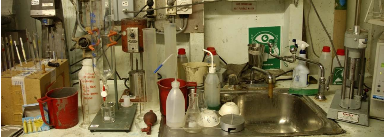
Can you find the eyewash? In the real world, eyewash stations are often badly marked, difficult to find, and difficult to operate fast in a panicked state, falling short of the real safety goal of treating eye burns quickly.

The unfortunate truth is that real-world eyewash installations often fall short of these safety goals. In many labs, the eye wash station is not well located, not well marked, and difficult to find. Moreover, a free-standing station requires a bucket (and probably additional cleanup) for weekly testing, which may deter testing from actually being performed as often as required.